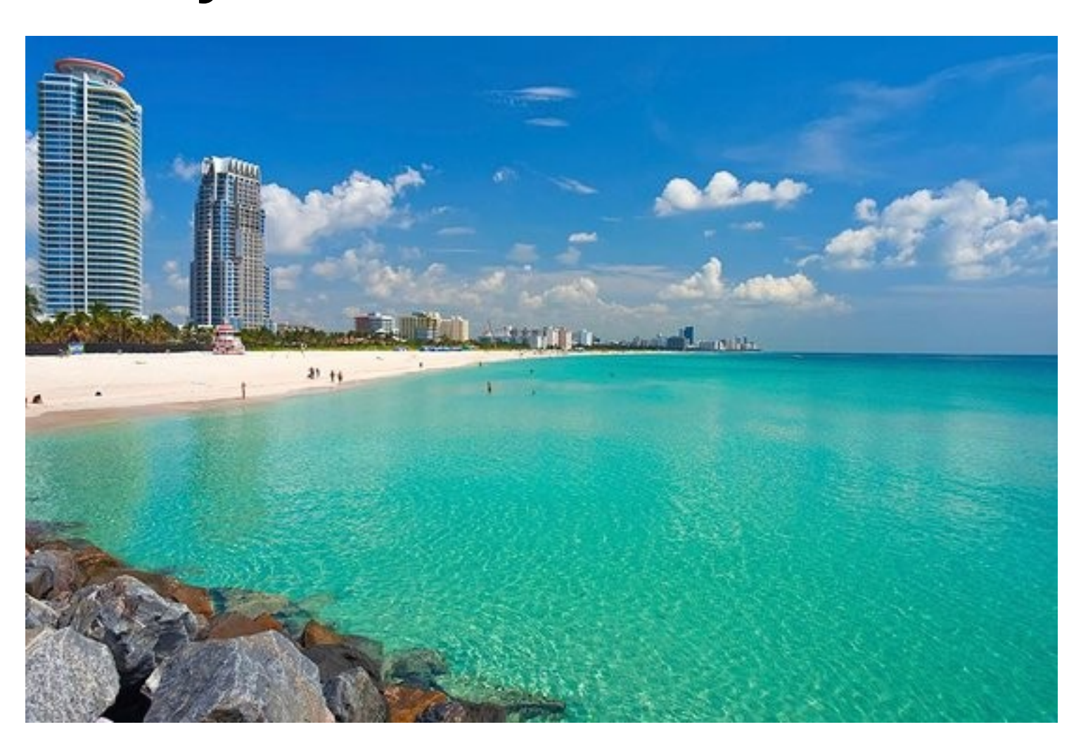
€675 (2 people)